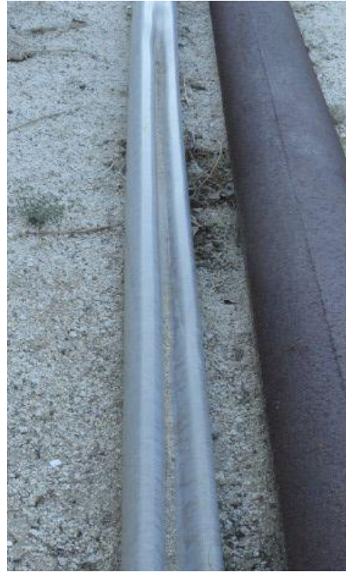
Strong vacuum pressure on pipeline