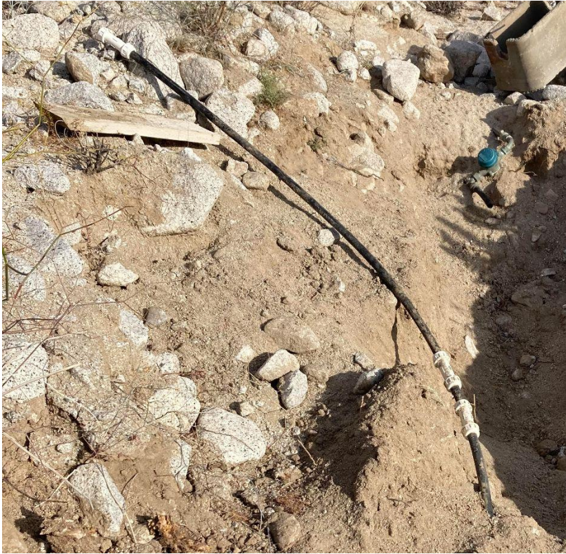
Many repairs in the same location at higher elevations