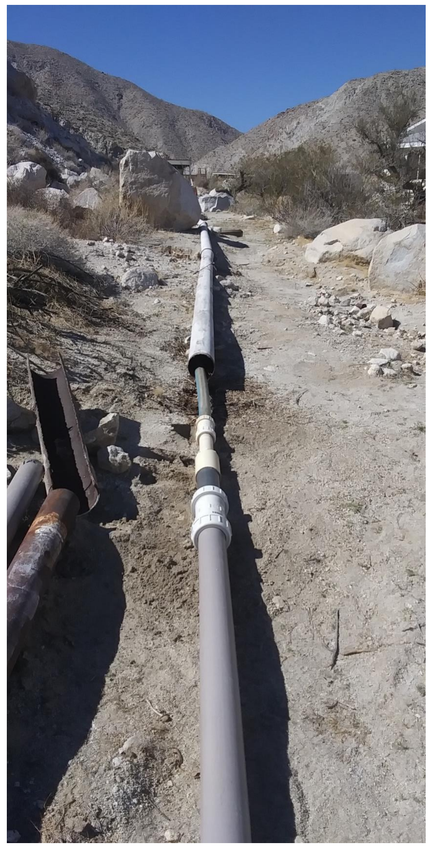
Connection to old 2-inch line